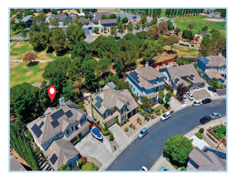
THIS INFORMATION IS DEEMED RELIABLE BUT IS NOT VERIFIED. EACH OFFICE IS INDEPENDENTLY OWNED AND OPERATED.